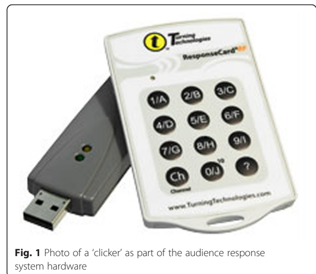
Fig. 1 Photo of a 'clicker' as part of the audience response system hardware

The personal wireless 'clicker' allowed individuals to make a choice from several options, with their choices logged directly onto a computer.