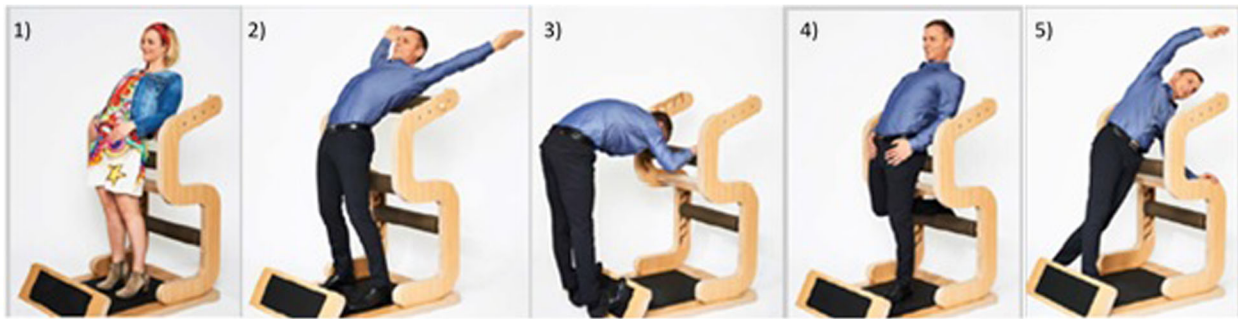
Fig. 2 All 5 exercises of the “five-Business”: exercises in the order of execution: 1) Stand, 2) Chest, 3) Ischio, 4) Hip and 5) Lateral