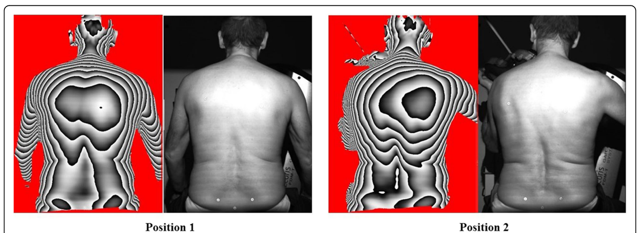
Fig. 2 Group 1: Showing comparative positions 1 / 2