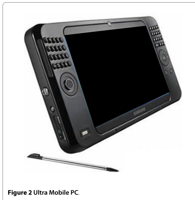
Figure 2 Ultra Mobile PC.

The Ultra Mobile PC can operated singlehanded and permits the exact time registration by touching the screen. After monitoring, data will be analysed statistically and graphically: the number of individual occur-