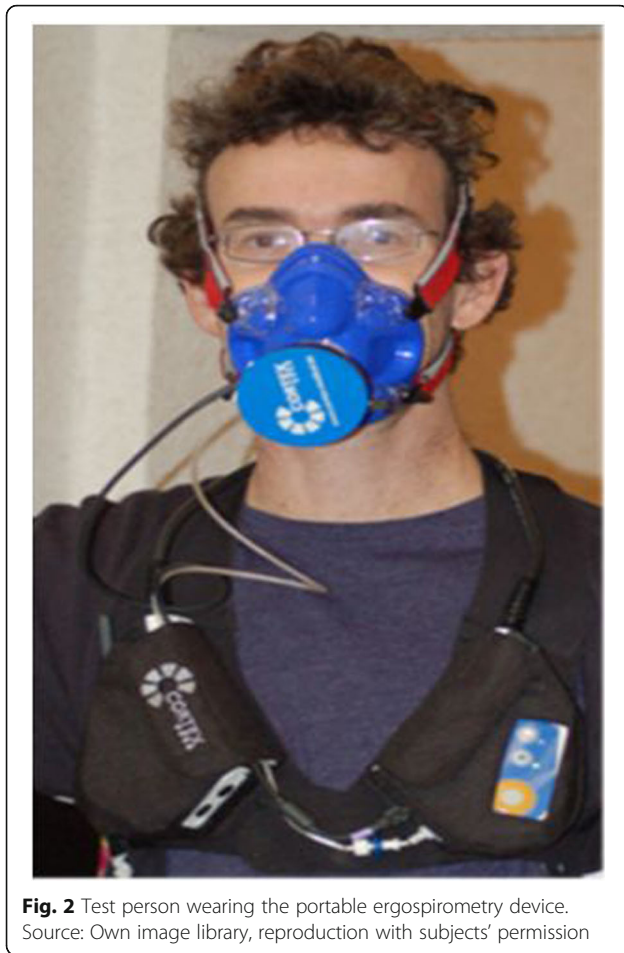
Fig. 2 Test person wearing the portable ergospirometry device.

time in the field test was 52 min (SD 10.7), the median 50 min (IQR = 48–55).